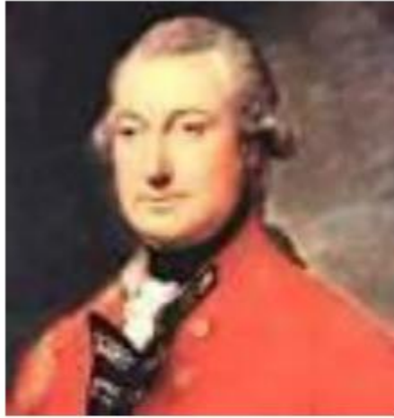
Lord Cornwallis introduced the Permanent Settlement of Bengal