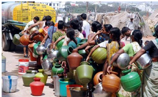
In poorer neighbourhoods, people often queue up for water and ugly fight sometimes ensue.

Those who can afford it solve the problem of short supply by buying water from private companies or by digging bore-wells. Those who cannot, have to Manase with far less than what is generally considered the minimum requirement of about seven buckets per person. Thus, people living in slums may have to manage with less than one bucket per person, while people living in well- to-do neighbourhoods may use more than forty or fifty buckets per person.