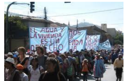
Protests in Bolivia took place when a private company increased water rates

We find that public services are essential. However, it has been noticed that there have been inequalities in water supply. The Government has to ensure equal distribution of water and other facilities to the people irrespective of wealth or locality.